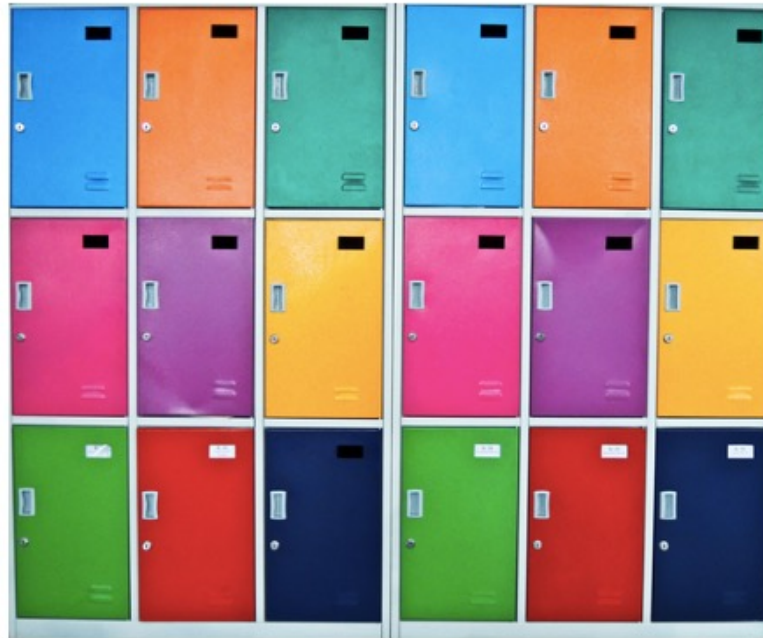
Figure 1: Lockers in rows and columns

A row has horizontal elements. A column has vertical elements. In the picture below there are 3 rows of lockers and 6 columns.